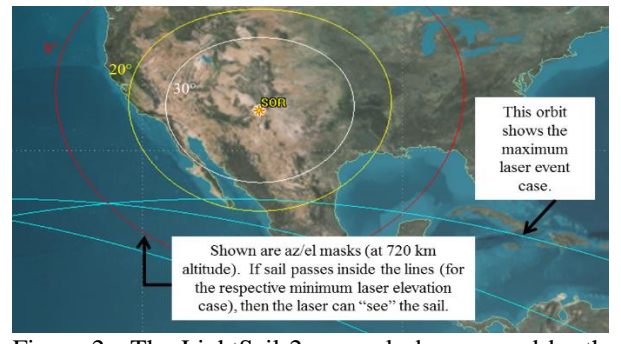
Figure 2. The LightSail 2 can only be engaged by the SOR laser at low elevation, likely violating range safety requirements.

Copyright ©2017 by the International Astronautical Federation (IAF). All rights reserved. One or more authors of this work are employees of the government of United States, which may preclude the work from being subject to copyright in United States, in which event no copyright is asserted in that country."