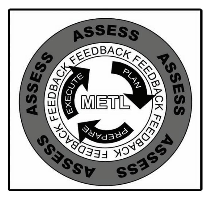
Figure 3-1. The Army training management model

3-4. Figure 3-1 illustrates the Army training management model, which is derived from the operations process. Units first identify the few critical full spectrum operations mission-essential tasks to train. Then they plan, prepare, execute and assess the training. The same process applies to leader development.