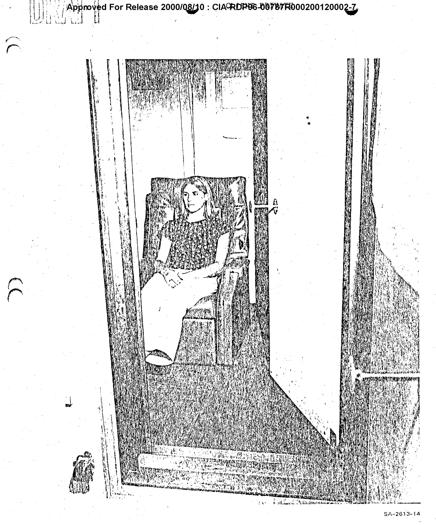
FIGURE 1 SHIELDED ROOM USED FOR EEG EXPERIMENTS